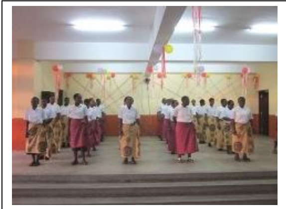
Dancing and singing was a great treat for all present. Thank you our dear novices and postulants.