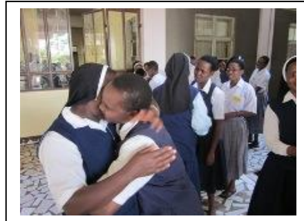
Welcomes come in different ways, like a hug, a good laugh or just sharing all that has happened.