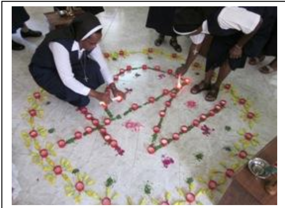
Preparing our ambience for the closing ritual