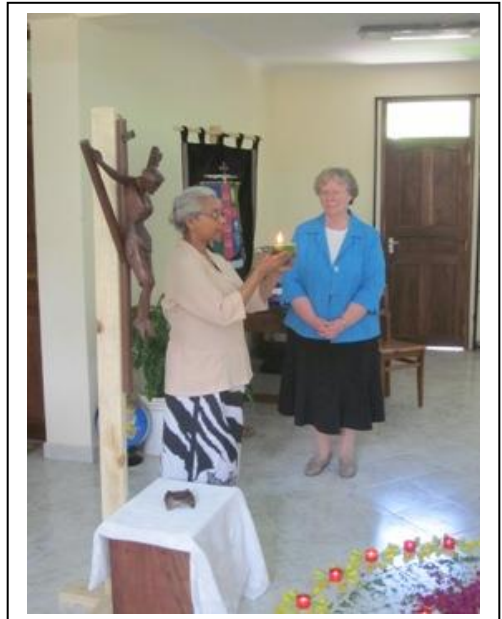
One new light for our new creation!